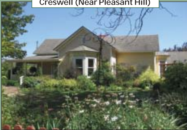
Creswell (Near Pleasant Hill)

Close-in country living on 11.9 acres just minutes from Eugene. With over 900' on year-round Bear Creek, this charming vintage home has been beautifully restored while maintaining the style of the original 1900 farmhouse. There are 3 bedrooms, 2 baths and very open living. The gourmet kitchen includes gas cooking and looks out on exceptional flower and vegetable gardens that surround the house. A separate 384 sq. ft.